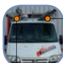
A half rack as an extra on the right